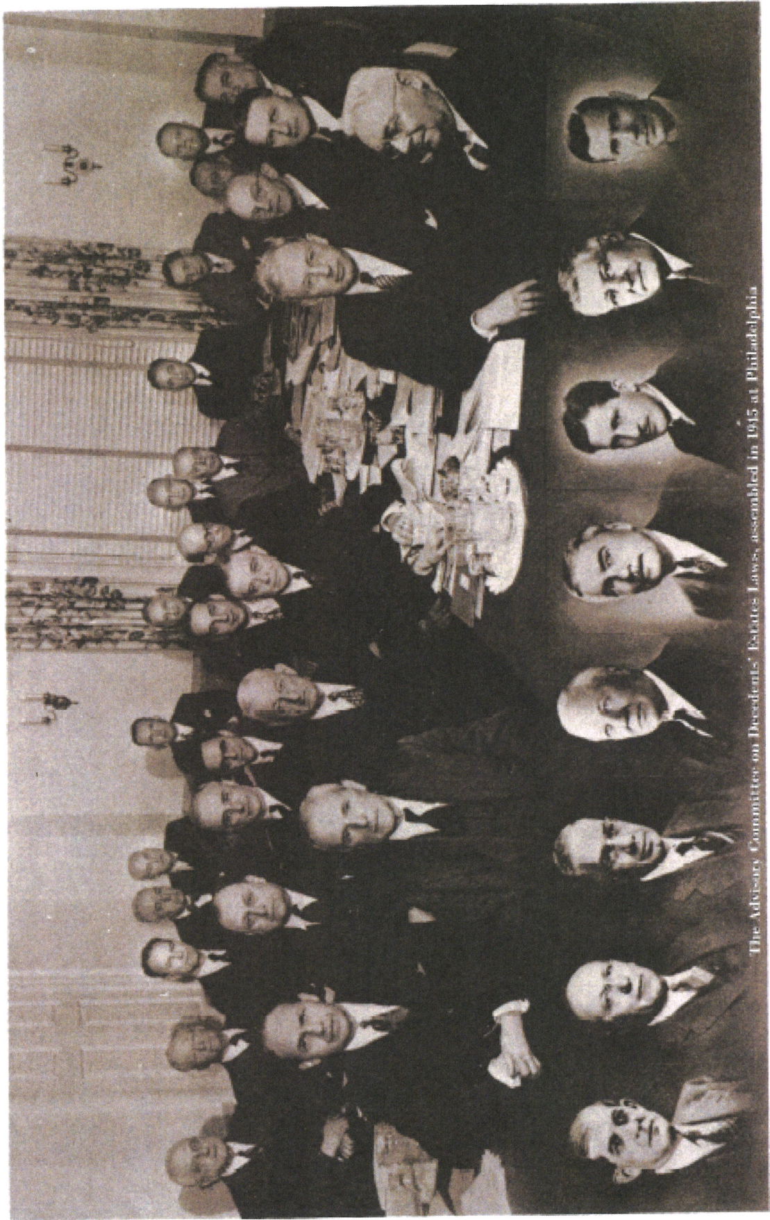
The Advisory Committee on Decedents' Estates Laws, assembled in 1945 at Philadelphia